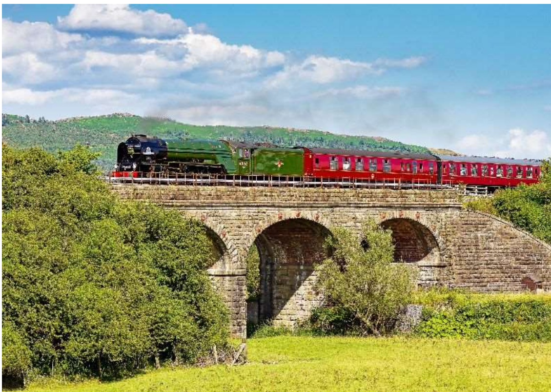
No. 60163 Tornado at Gargrave

There is nothing better than main line steam, especially with Tornado at the head of the train, so please have a look at the diary below and we look forward to welcoming you on-board.