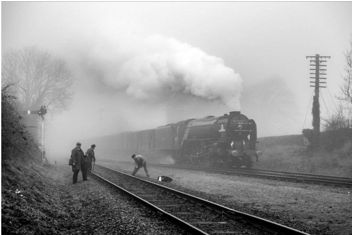
No. 60163 Tornado at the Great Central Railway Photo Charter

60163 TORNADO New Steam for the Main Line